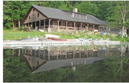
The Wa Wa Segowea lodge, built on the banks of Harmon Pond, is slated for renovation.

Before long, William spotted the perfect location for the camp: Foley Farm located on Foley Hill Road in Southfield. The farm, owned by (you guessed it) the Foley family, sat on approximately 500 acres and surrounded